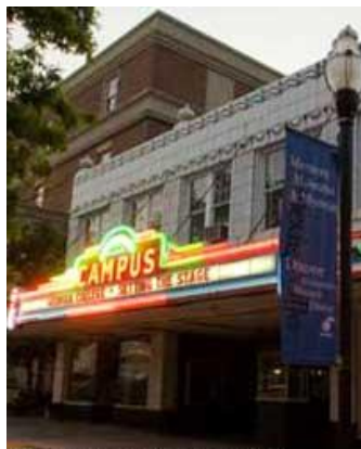
Campus Theater marquee at dusk

The Milledgeville economy has suffered in recent years due to plant closures and state facility cutbacks, but the university and the College of Business have been active in economic development. Foot traffic from the university provides a steady stream of walk-in trade for downtown restaurants and shops. In 2010 the university refurbished a long-shuttered downtown theater, creating a bookstore, performance venue, and home for the theater department. The College of Business is actively involved in Digital Bridges , a venture with the Knight Foundation, to provide technology access to individuals and small businesses in the surrounding community. Technology integration across the community has been facilitated by a wireless system that extends around the county. Aided by the university, the local community received a state grant to implement that wireless system. Business faculty and staff are very heavily involved in the community through service agencies and clubs. Recently the university led a joint academic and economic development visit to India to