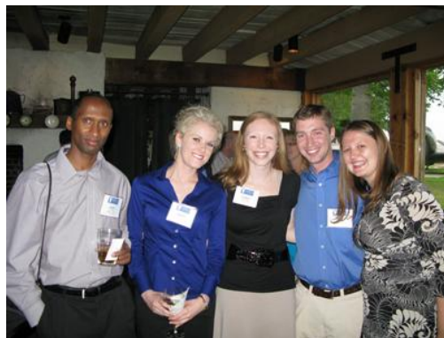
Atlanta alumni event, April 2011